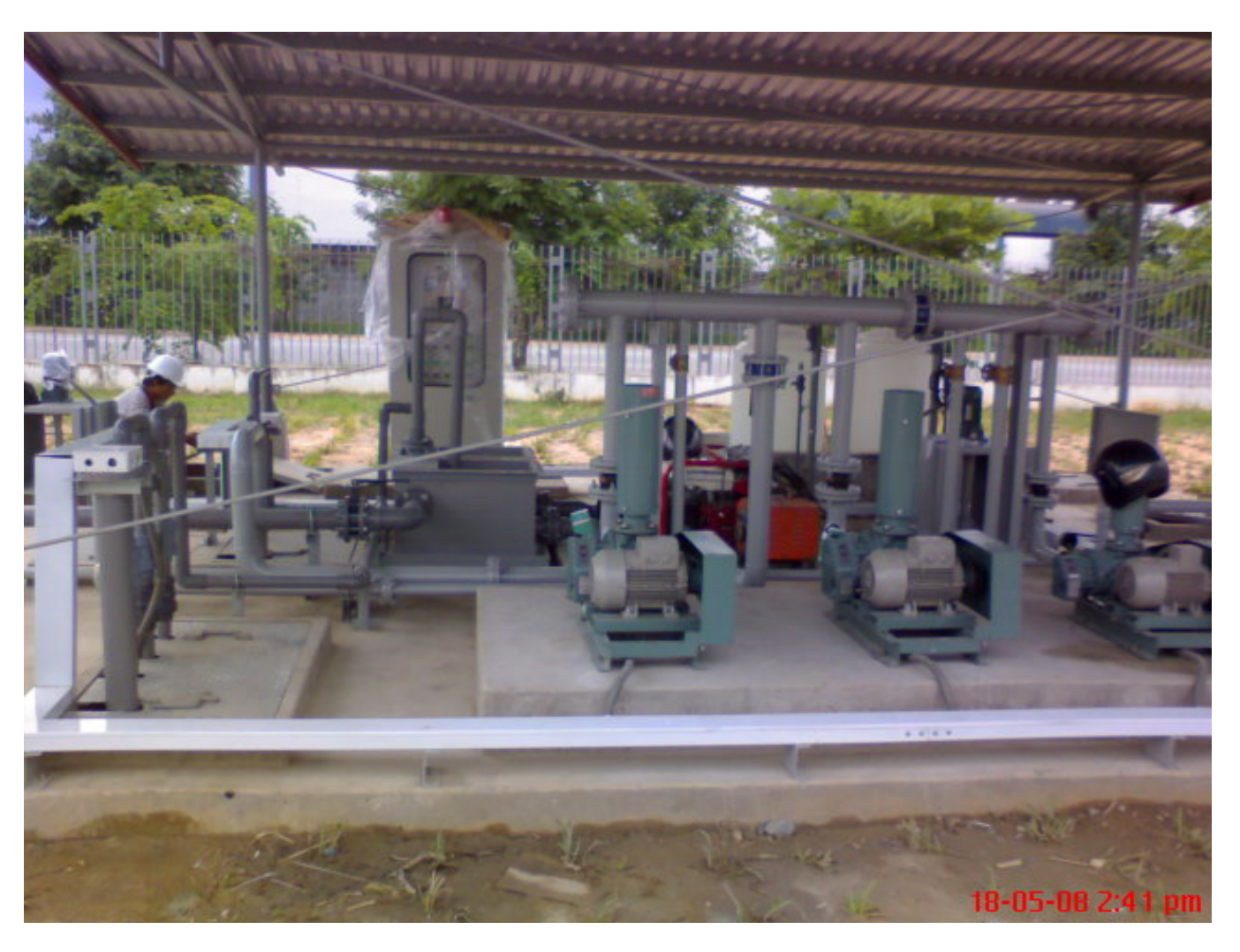
Sewage Waste Water Treatment Plant Cpacity 5m3/h